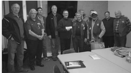
Donating Check for St. Gerard's Projects