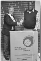
Donating Medical Supplies

Join in true fellowship next Sunday (March 8th) after the 8:30 and 10:30 Masses. Please mark your calendars, invite a friend, take your grandkids (yes, there is whip cream and sprinkles!), and plan to eat some good food, laugh, share stories, meet some new people at Church all while donating to great ministry.