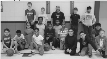
Community Free-throw Contest