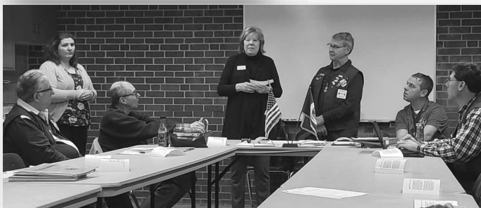
CEAP and Robbinsdale Women's Center accepting checks